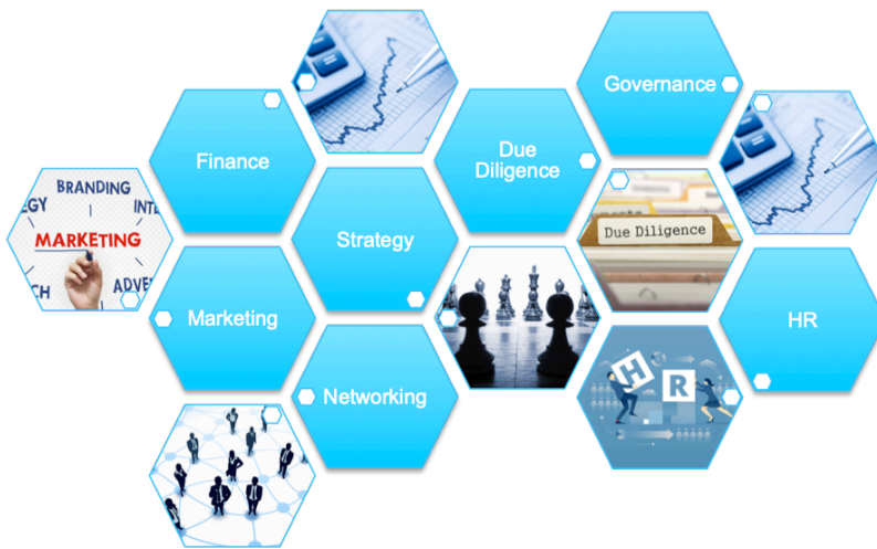
SF Value Added Services